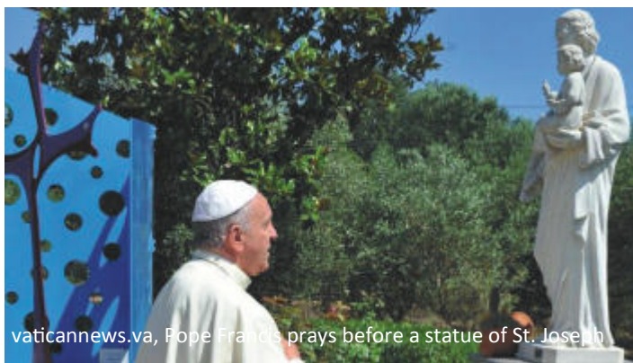
Pope Francis prays before a statue of St. Joseph

World Day of Prayer for Vocations will be observed on Sunday, April 25, 2021 also known as "Good Shepherd Sunday." The purpose of this day is to publicly fulfill the Lord's instruction to, "Pray the Lord of the harvest to send laborers into his harvest" (Mt 9:38; Lk 10:2).