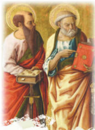
STS. PETER & PAUL, APOSTLES

consolation simply resting in God's presence. Our naked being, stripped of any pretense or self-serving agenda, is being called to rest in and love the uncreated Presence of God. Reach out in love to God. Ask God to heal you from all that separates you from Him. Put aside any ideas of God that create barriers between you and God's tender and endearing presence. The Cloud of Unknowing leaves us with wisdom, "think of yourself and of him in the same way, that is, with the simple awareness that he is as he is and that you are as you are." This is a meeting of two friends who desire nothing more than to share life together.