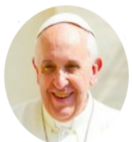
Pope Francis ✓