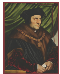
Followed by the 14 th ANNUAL BENCH AND BAR AWARD DINNER with presentation of the St. Thomas More Award

The Sutter Club 1220 9th Street Sacramento, California 95814