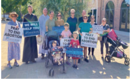
"Before I formed you in the womb I knew you, before you were born I dedicated you, a prophet to the nations I appointed you." Jeremiah 1:5