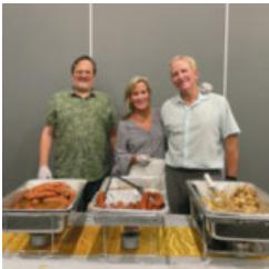
Thank you to all of the servers who made sure everyone had plenty to eat at the dinner!