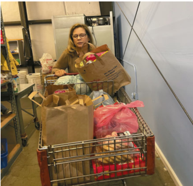
Taking care of business at the Food Locker.