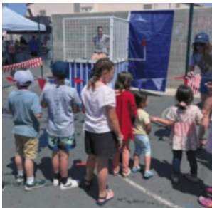
Students in line to dunk one of the OLA School teachers (left) and students "doing time" in the OLA Jail (right).

On Saturday, families were able to enjoy the midway games, OLA jail, the ever-popular dunk tank (thank you to all of the OLA teachers who got dunked), professional face painters, and balloon artists! There was also live music and a wonderful BBQ dinner.