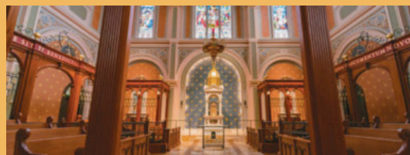
Solemnity of the Anniversary of the Dedication of the Cathedral of the Blessed Sacrament