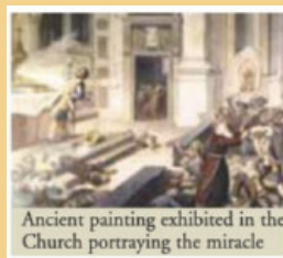
Ancient painting exhibited in the Church portraying the miracle

Eucharistic Miracle of Bagno di Romagna Italy, 1412